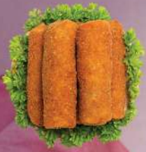
FISH ROLL 12 PIECES