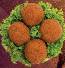
FISH CUTLET 12 PIECES