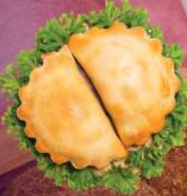
FISH PATTY 12 PIECES